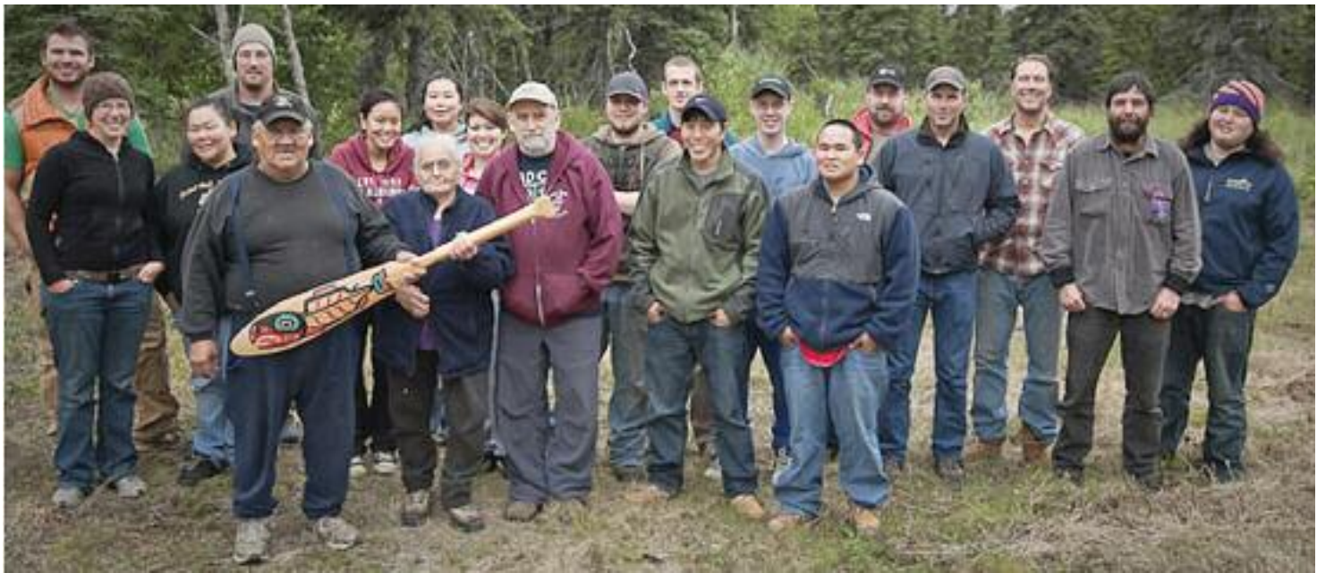
Teens and young adults learn the fine art of fly fishing from professional fishing guides and outdoor writers at the Bristol Bay Fly Fishing Guide Academy, Ekwok, Alaska.